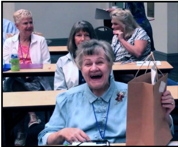
Fun at the Annual Meeting