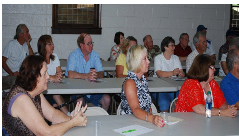
Kentucky River members at their first meeting