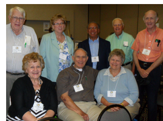
N. Ky members at Annual Meeting