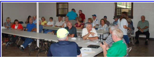
Members of the new Kentucky River Chapter discuss plans for the future.

KPR greatly appreciates all the hard work that was required to create this chapter!